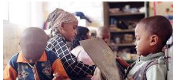
Concrete vs Classroom, children are able to learn at MMC Centers

"An age-appropriate education program for young children fulfils the needs and requirements of growing children, physical, social, emotional and intellectual. They need to explore and interact with a lot of different materials and have various interesting experiences. Therefore there was a need to develop a program that would provide the children a lot of variety." Says Pragna, who after 3 months has completed the initial report on her findings and recommendations and learning for how this pilot can be incorporated into more MMC centers.