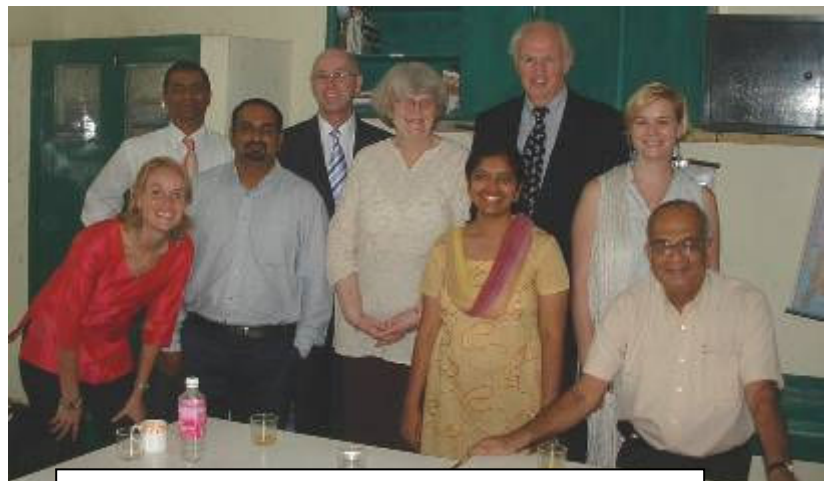
Dutch & Australian Consul Generals of Mumbai visit Atma Mumbai and Muktangan