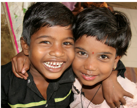
Happy faces children love learning!

It has been a wonderful outcome for Mumbai Mobile Creches, and Atma Mumbai hopes to continue such initiatives in the future. The success was made possible through Cara's determination to do something for the children of India, and reminds us all that we can really all make a difference.