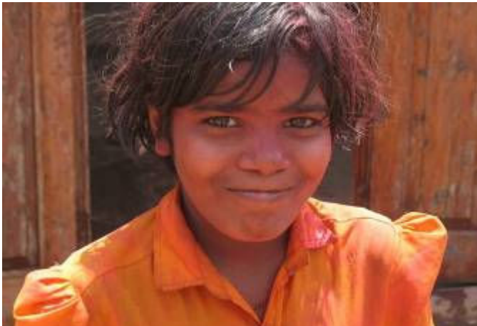
Children of Nareshwai celebrate Holi Festival

The weather has changed here in Mumbai, and we are now in the clutch of summer. One of the favorite and most colorful Hindi festivals is celebrated in March. Holi is a festival which marks the beginning of spring and which is celebrated by playing with water balloons and colored powders and the like! Atma Mumbai spent this Holi with the children of Nareshwadi in a fun-filled weekend for all.